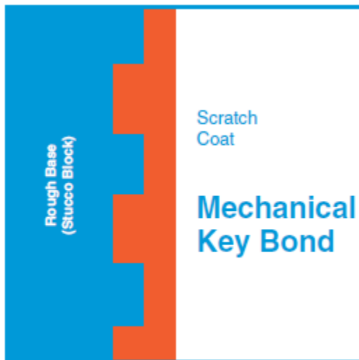
Figure 1 – Mechanical key bond

There is another factor at play in achieving bond on concrete and that is the surface texture of the concrete. Concrete usually has a very smooth surface with no mechanical keying ability. However, stucco needs two types of bond to ensure a durable finish.